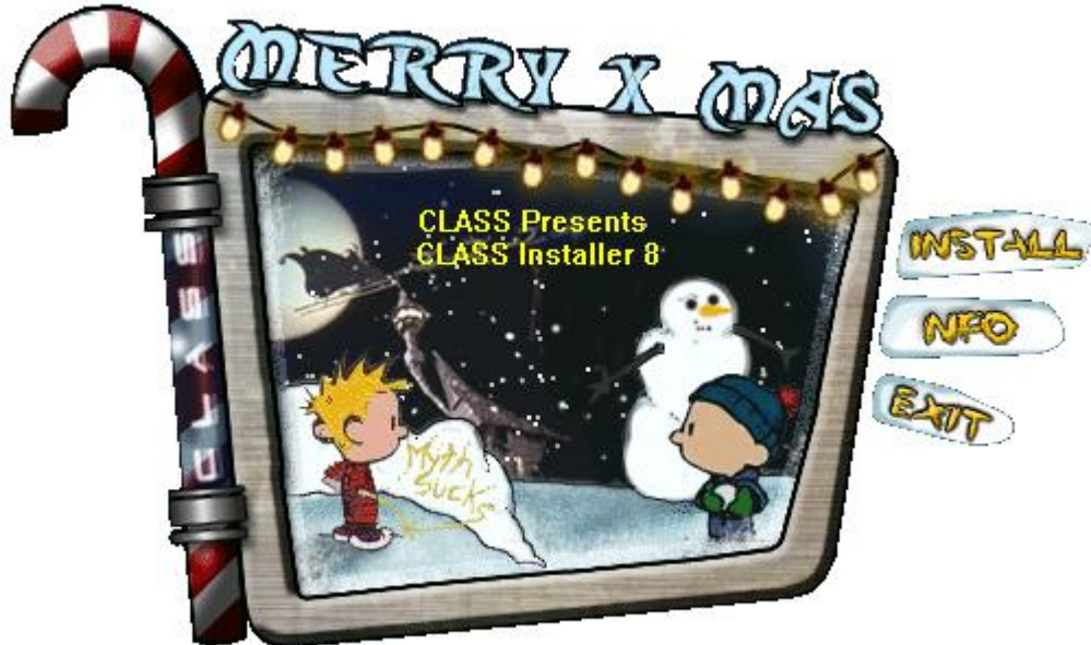
Figure 1: CLASS warez installer (note Myth Sucks in snow)

Note: there is no guarantee that the files on this site are not riddled with Trojans or viruses.